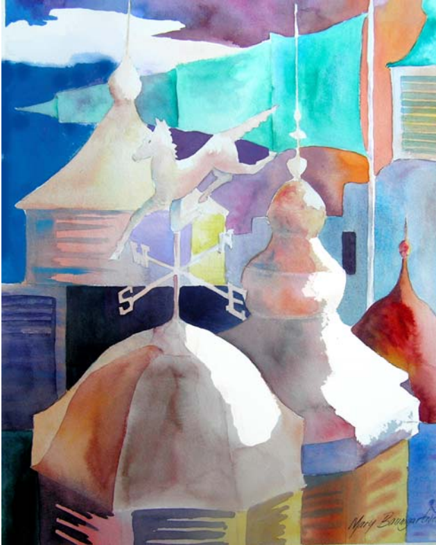
"Bird's Eye View"

for that teacher's students. Make sure you purchase the supplies required.